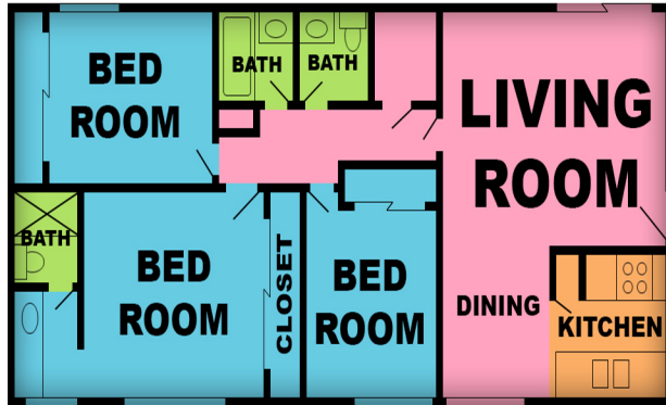
3 Bedroom | 2 Bath