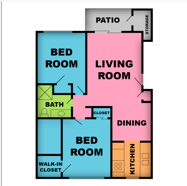
2 Bedroom | 1 Bath