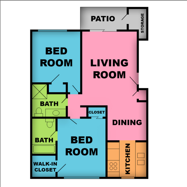
2 Bedroom | 2 Bath