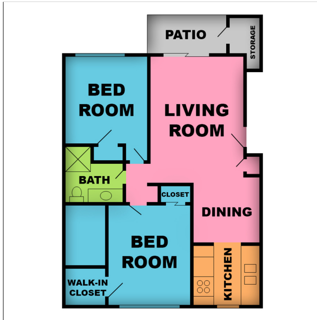
2 Bedroom | 1 Bath